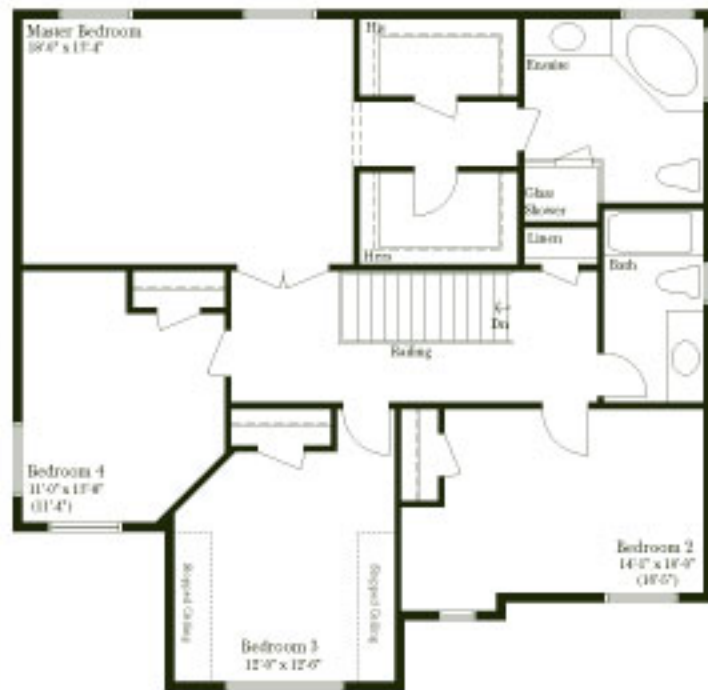
SECOND FLOOR PLAN ELEVATION 'A'